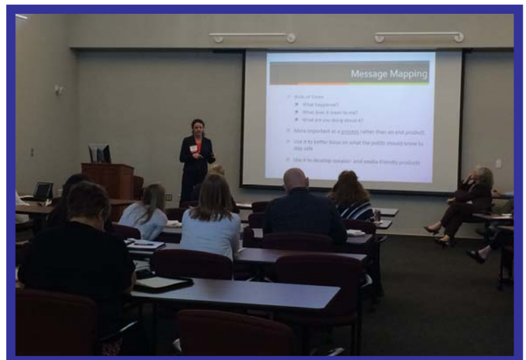
Coverage from the Region VII Public Health Affiliates Annual Meeting (page 13) held in Columbia, MO on May 18-19, 2015.

The Missouri General Assembly had one of the more "unique" sessions this year. The Auditor's office, resignations of a Speaker, Right to Work filibuster and election of a new Speaker were just a few developments. Ferguson dominated the session early and the legislature adjourned early. Interim committees on managed care and education will begin shortly in preparation for the next round.